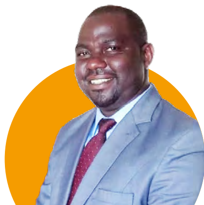
Rogers Mugenyi Leadership Training